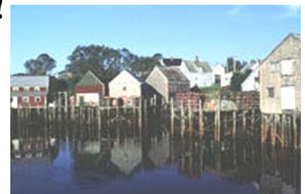
New Brunswick, Canada