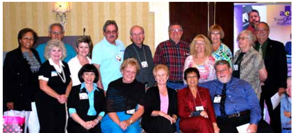
2010-11 AEA-Retired Board of Directors