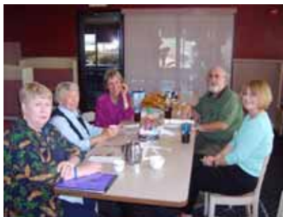
Prescott Valley Chapter