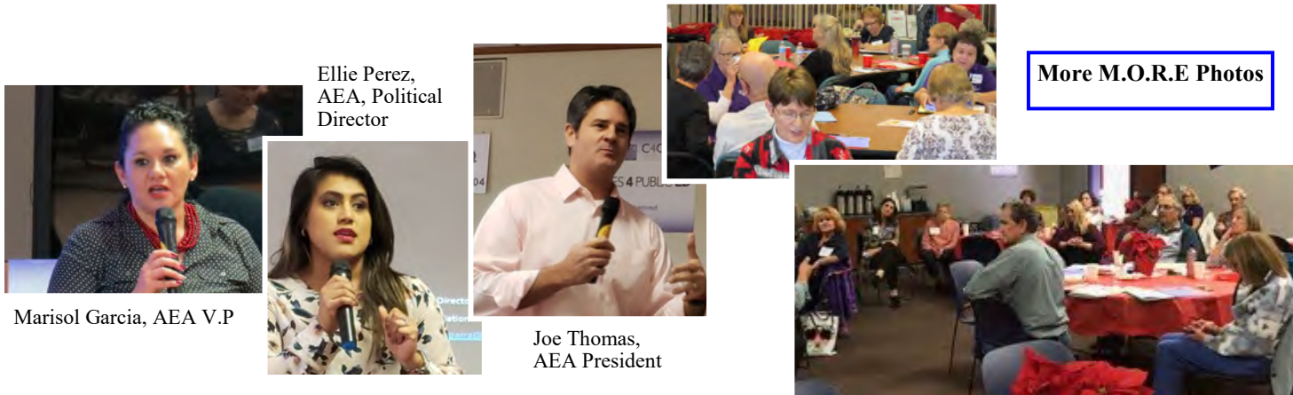
More M.O.R.E Photos

Detach this form and send/deliver to AEA-R, Attn: Elections, 345 E Palm Lane, Phoenix, AZ 85004