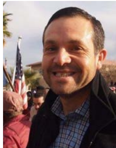
AEA Executive Director