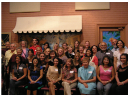
November Tucson celebration