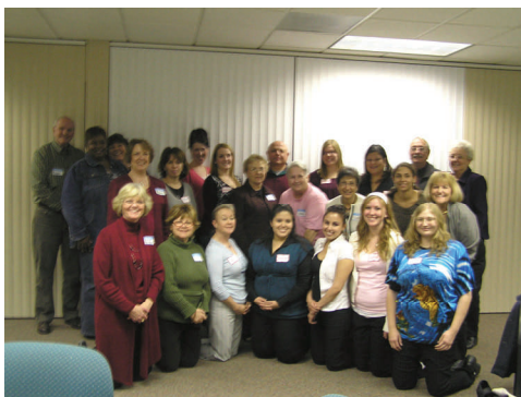
Phoenix Celebration, February 4