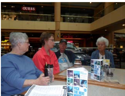
Row 5, Phoenix Chapter meeting