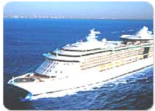
Our ship: Royal Caribbean's Jewel of the Seas