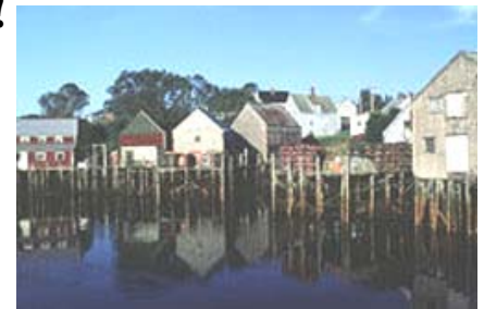
New Brunswick, Canada