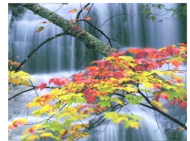
New England fall foliage is a riot of bright colors