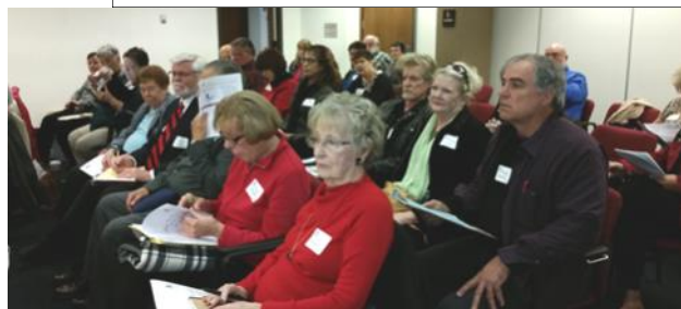
AEA-Retired members listen intently and take notes to prepare for meetings with legislators and the day's activities.